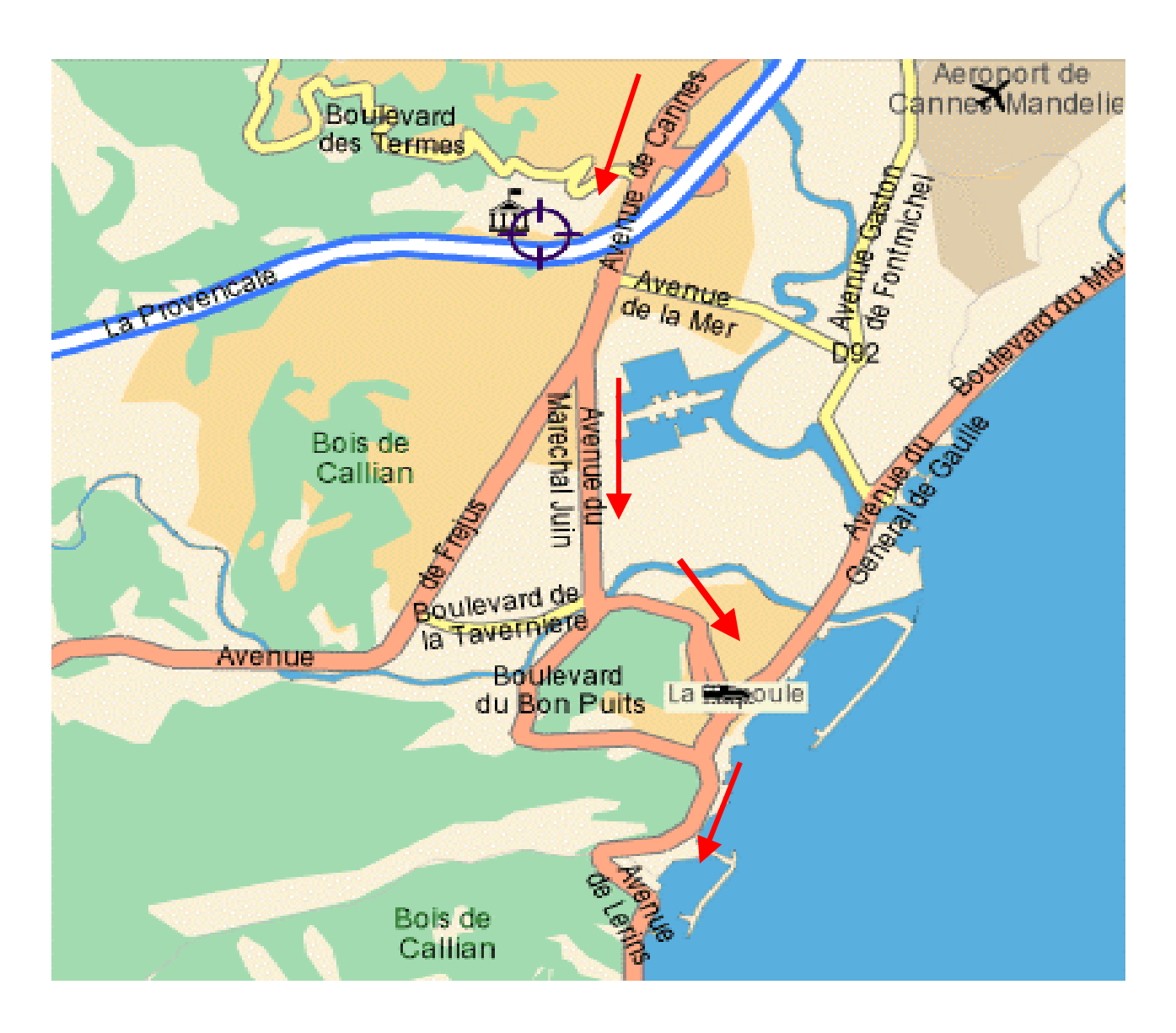
In La Napoule , follow the road of the coast in direction of Le Trayas and Saint Raphael .

At 8 kilometers of Le Trayas, you will see on the right a large viaduct, at 1 kilometer after the viaduct, on your left looking for N° 2014, a Red gate.